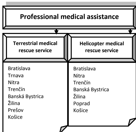
Fig.2 Centres of professional medical assistance

Helicopter rescue service is in the state of alert 24 hours a day in the centres listed in the following overview (Fig. 2).